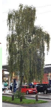
Silver birch branching