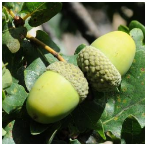
A pair of acorns