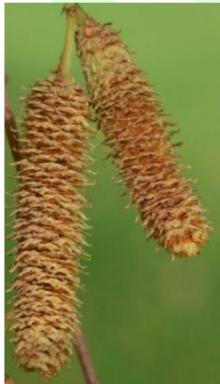
Dry birch catkins

However, flowers will have developed into fruit during the summer, so we can't hope to see flowers at this time of year - only the fruit they have developed into.