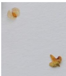
Birch catkin pieces