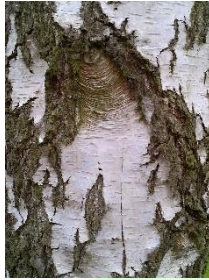
Silver birch bark.