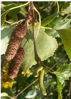
Two kinds of birch catkins

Try curving your arms inwards a little and imagine holding giant seeds under your arms.