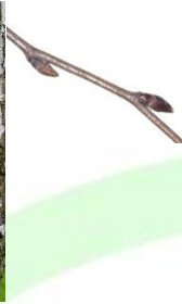
Silver birch buds