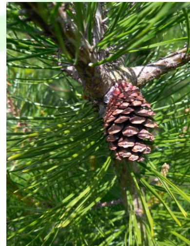
An even older cone!