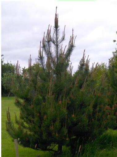
This pine is quite bushy.

Here are photos of a pine tree that grows on the hills of the Welsh Valleys – and near to me!