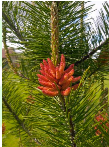
Male flowers are yellow and pink.