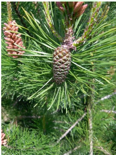
Last year's cone is green-grey.