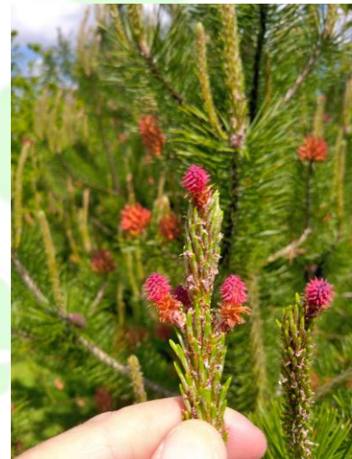
Female flowers are bright pink.