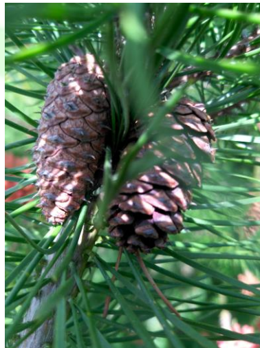
Brown cones from the year before last