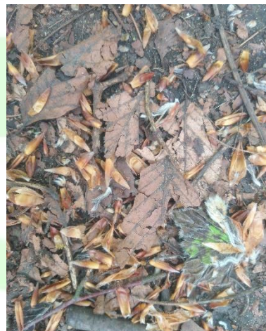
Discarded bud scales fall away. Seeing them on the ground, we know we shall see a beautiful beech tree.