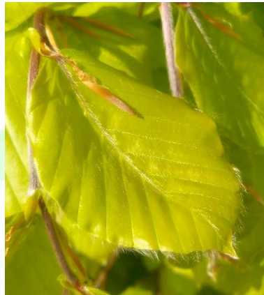
Fresh green leaf fringed with hair. Note, also, the long thin bud husk.