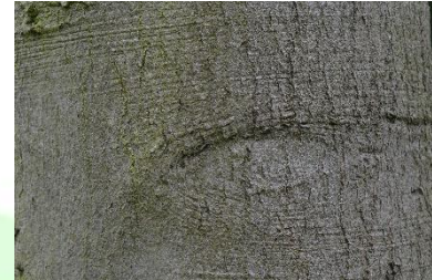
Grey bark with the texture of toast.