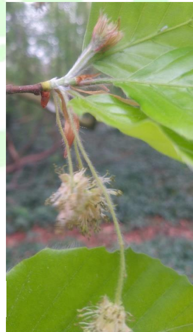
Dangling pollen-bearing pom-pom flowers and, above, a tufted flower that will develop into fruit.