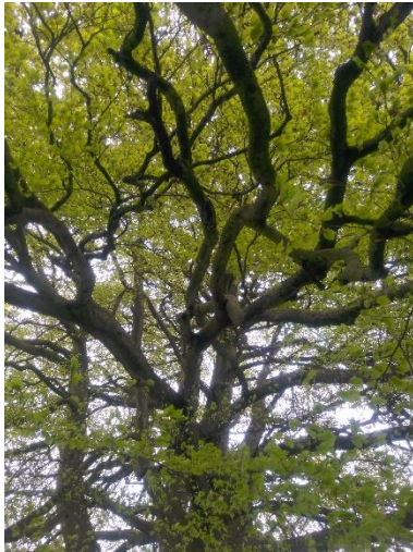
Looking up into the branches. Judging by the size of its trunk, the tree is more than 200 years old.

Here are some of the photographs that I took of 'my' beech tree: