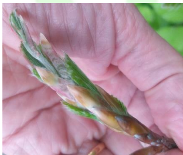
Bud scales peel back as the shoot emerges. We can see the squashed leaves unfurling.