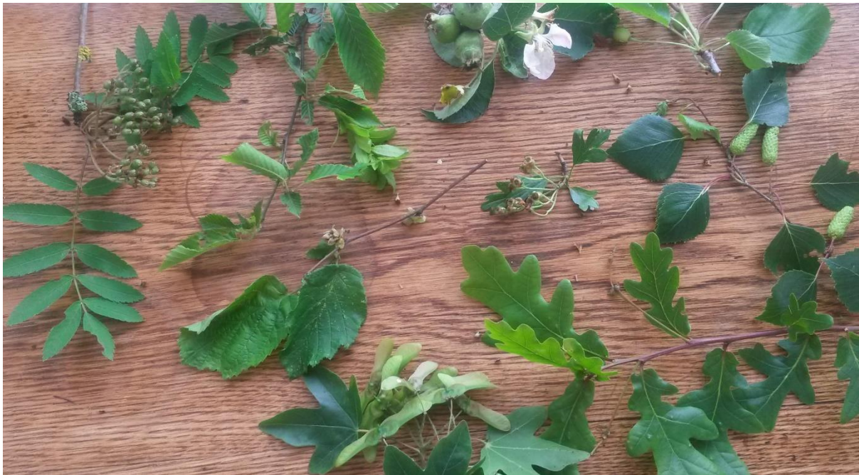
Rowan, hornbeam, apple, cherry, birch, hazel, hawthorn, field maple and oak fruits

Here are some of the developing fruits that I found.