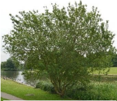
Female pussy willow tree

There is another tree, a female pussy-willow tree, that has the kind of flowers that will grow seeds if they collect pussy willow pollen.