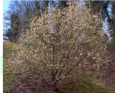
Male pussy willow tree

You are most likely to see the tree near water.