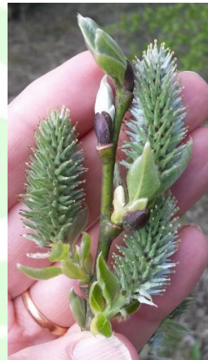
Female pussy willow flowers

For more about trees, fun things to look for and do indoors and outdoors, and about Hello Trees books see http://hellotrees.co.uk/