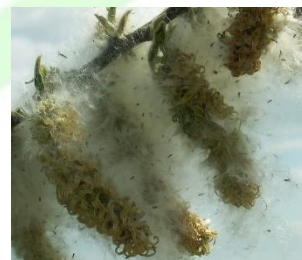
Pussy willow seeds