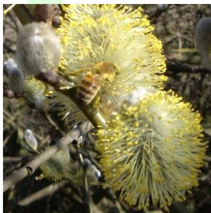
Pussy willow covered in pollen

Sometimes white or glossy things look silvery but, if you can get close to them, you will see that these really are silvery grey and silky, like a pussy cat's fur. We call them pussy willow and soon they will be covered in yellow pollen.