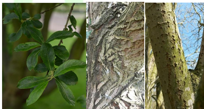
Pussy willow leaves

This is a male tree. It only has pollen-bearing flowers.