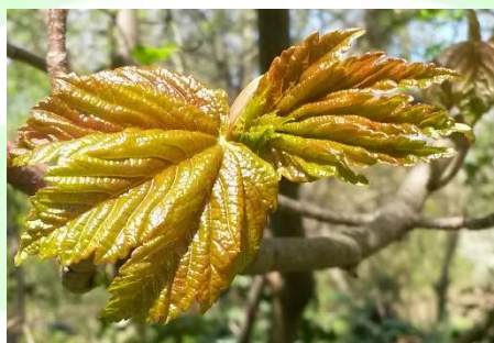
Young sycamore leaf