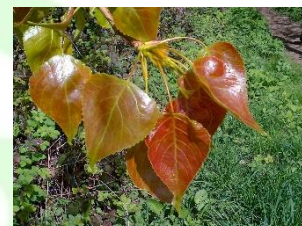
Young poplar leaf