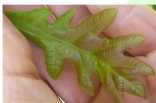
Young oak leaf

Here are some shades of bronze that I found in young leaves.