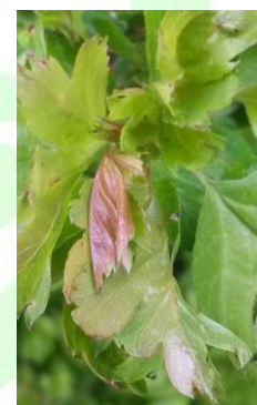
Young hawthorn leaves

I found that I could almost always find a tinge of bronze somewhere on new leaves. Did you?