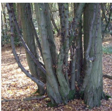
Bark on a coppiced hornbeam