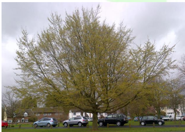
Hornbeam tree in Spring, covered in masses of catkins

Here are two photos showing the branching of a hornbeam tree near where I live: