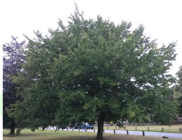
Hornbeam tree in Summer covered in leaves and fruit