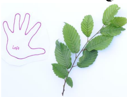
Hornbeam leaves next to a 5-year-old's hand

What words would you use to describe the leaves on your hornbeam? Would you agree that each leaf