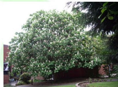
Horsechestnut tree in bloom

All with an 'f' sound: the 3 clues to a tree identity in Spring, Summer and Autumn.