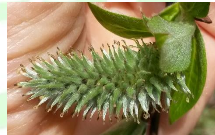
Pussy Willow (6E)

Male and female catkins on separate trees.